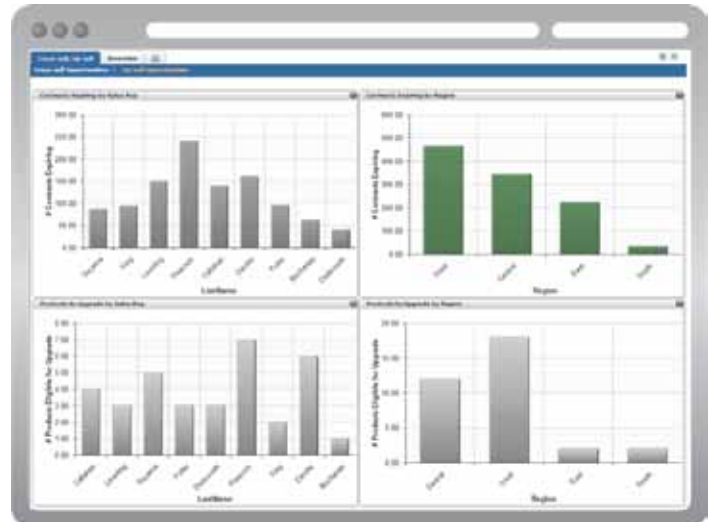
View opportunities to up-sell new products and add/renew maintenance contracts.