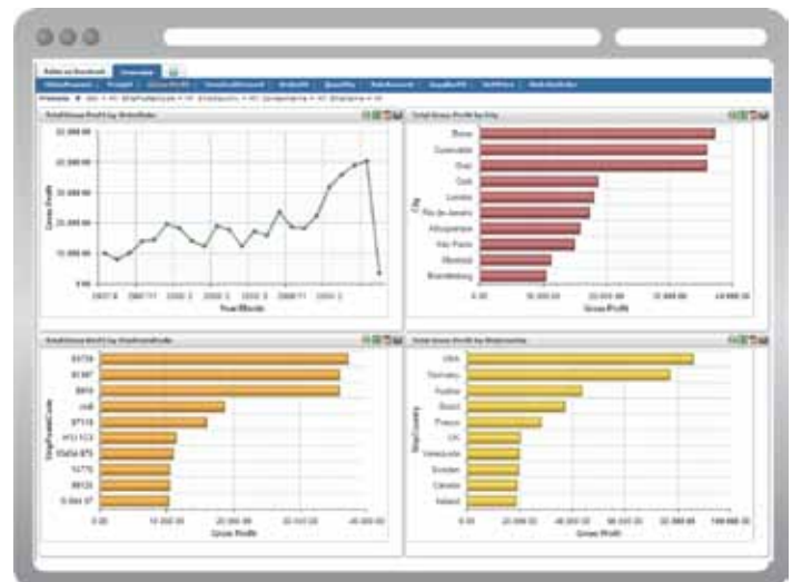
View gross profit for invoiced amounts by time period or geography.